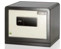
Ritz Home Safe I will shout and alert you whenever someone tries to open me.