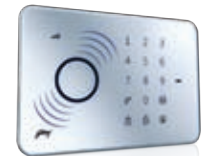
Eagle-I Pro Alarm System

I will instantly alert you on your mobile in case of any intrusion.