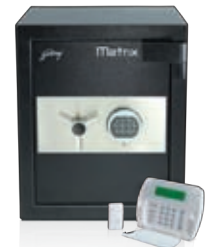
Matrix with I-Warn Electronic I will SMS you whenever someone tries to open me.