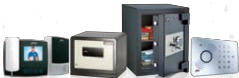
Video Door Phones