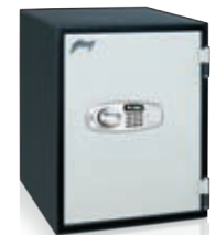
Safire Electronic I will protect your documents from fire.