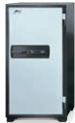
Centiguard I will protect your documents from fire.